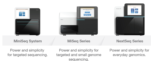
Figure 3: Illumina NGS portfolio of benchtop sequencers —Illumina NGS systems offer solutions for virtually every application, sample type, and sequencing scale. Each delivers high data quality and accuracy with flexible throughput and simple, streamlined workflows. Data can be easily compared, exchanged, and analyzed in BaseSpace Sequence Hub.

Also, sequencing data can be run through a wide range of open-source or commercial pipelines developed for Illumina data, or instantly transferred, analyzed, archived, and shared securely with BaseSpace™ Sequence Hub. BaseSpace Sequence Hub is the only cloud ecosystem that offers direct instrument integration, enabling automatic encrypted data flow directly from the instrument into the cloud ecosystem for analysis, storage, sharing, and other forms of data management. Additionally, BaseSpace Sequence Hub users can monitor the status of their runs through the cloud portal or through the iOS app for BaseSpace .