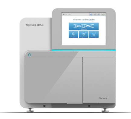
Figure 1: The NextSeq 550Dx Instrument—Leveraging SBS chemistry and user-friendly, regulated workflows, the NextSeq 550Dx Instrument delivers high-quality results for clinical and research applications.

‡ DRAGEN Server for NextSeq 550Dx Instruments is available in select countries.