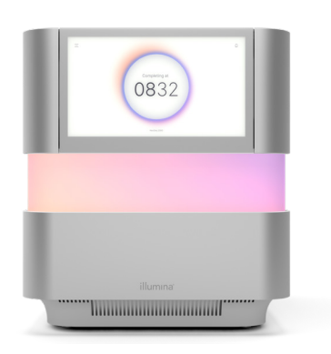
Figure 2: NextSeq 1000 and NextSeq 2000 Sequencing Systems— The NextSeq 1000 and NextSeq 2000 Systems harness XLEAP-SBS chemistry and onboard secondary analysis to streamline sequencing workflows.

RNA-Seg has guickly emerged as the paramount approach to high-throughput transcriptome profiling.<sup>1,2</sup> RNA-Seq provides a detailed snapshot of the transcriptome at a given point in time and offers numerous advantages over quantitative PCR, including: