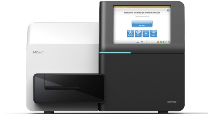
Figure 1: MiSeq System—The compact MiSeq System is well suited for rapid, cost-effective next-generation sequencing.

The MiSeq System offers the first DNA-to-data sequencing platform integrating cluster generation, amplification, sequencing, and data analysis into a single instrument. Its small footprint—approximately two square feet—fits easily into virtually any laboratory environment (Figure 1). The MiSeq System leverages Illumina sequencing by synthesis (SBS) chemistry, a proven next-generation sequencing (NGS) technology cited in over 300,000 peer-reviewed publications—5× more than all other NGS technologies combined. 1 With the power of NGS delivered in a compact footprint, the MiSeq System is the ideal platform for rapid and cost-effective genetic analysis.