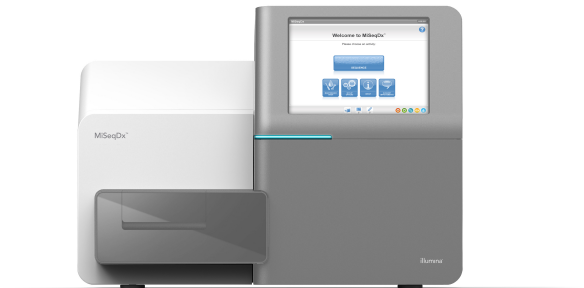
Figure 1: MiSeqDx Instrument —The FDA-regulated, CE-IVD–marked MiSeqDx instrument offers a simple workflow, a user-friendly software interface, and enhanced user security.

Compared to capillary electrophoresis-based Sanger sequencing, NGS can detect a broader range of DNA variants, including low-frequency variants and adjacent phased variants, with a faster time to result and fewer hands-on steps. 1,2 Illumina SBS chemistry employs natural competition among all four labeled nucleotides, which reduces incorporation bias and allows more robust sequencing of repetitive regions and homopolymers compared to other sequencing systems. 3 Comprehensive results are delivered quickly, eliminating the need for time-consuming reflex testing.